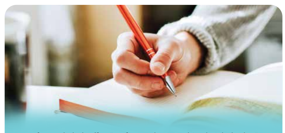
MetLife Bangladesh offers "Professional Actuarial Study Scholarship" to students aspiring to become future Actuaries. The scholarship provides full financial support for actuarial study and access to the knowledge and experience of MetLife's international pool of actuaries.