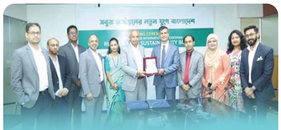
MetLife Bangladesh invested in the country's first internationally certified sustainability bond, issued by Runner Automobiles, which will use the proceeds to provide credit to customers buying low-emissions three-wheel vehicles. Runner also plans to use the funds to build a rooftop solar plant on its manufacturing facility.