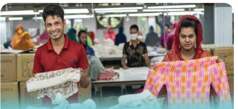
Funded by MetLife Foundation and implemented by Swisscontact, project "Sarathi" has helped over 440,000 RMG workers with direct access to financial and economic resilience-building products and services.